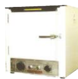
Hot Air Universal Oven