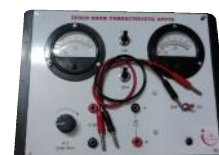
Zener Diode Characteristics