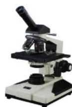
Monocular Reserch Microscope