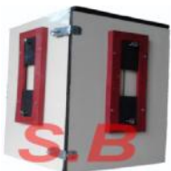
Mercury Vapour Lamp