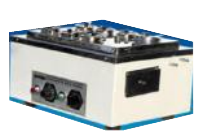
Laboratory Paraffin Water Bath