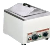
Serological Water Bath