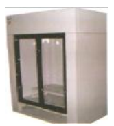
Garment Storage Cabinet