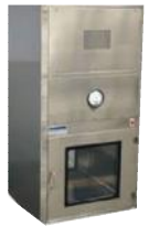
Dynamic Pass Box