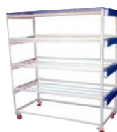
Tissue Culture Rack