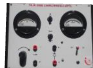
PN.JN. Diode Characteristics