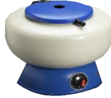
Medico centrifuge Machine